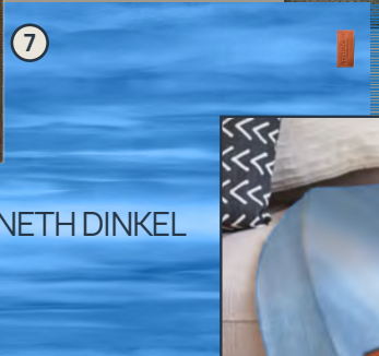
ABSTRACT MOOD Captivating focal point & conversation starter