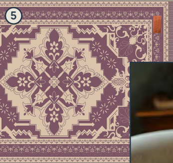
PERSIAN RUG INSPIRED Beautiful bold colors & patterns