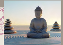
MAKE IT ZEN Relaxing, sophisticated & calm